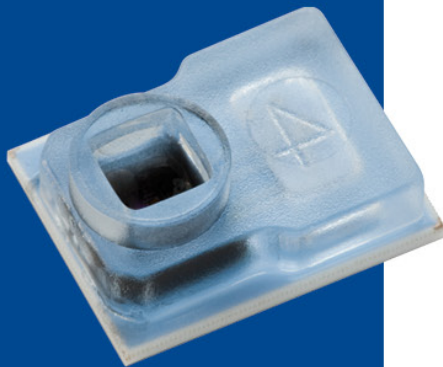
BP Series Blood Pressure Sensor