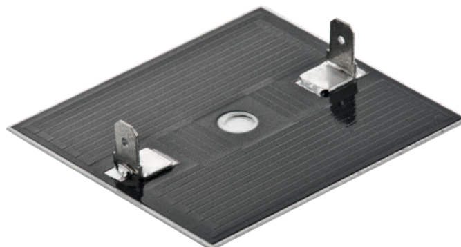
Fig. 1: Thick film braking resistor on ceramic substrate

In addition to the development of thick-film power resistors, the next step is to work increasingly on the further development of pastes for precision resistors.